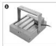
GALA U Series