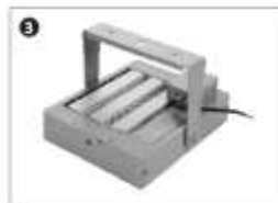
GALA U Series